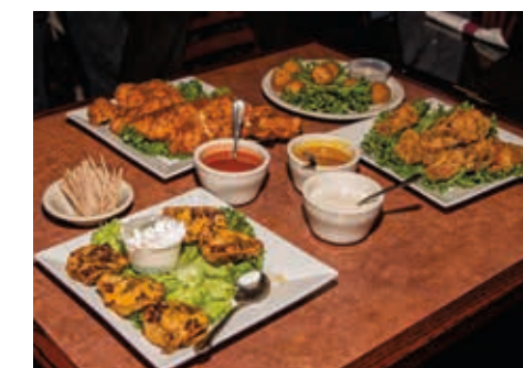
A small sampling of appetizers that kept coming.