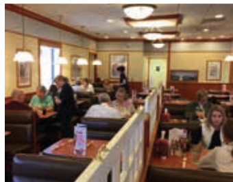
Lunchtime at Friendly's on N. Park Road