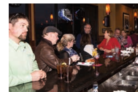
We filled up the lounge bar area.