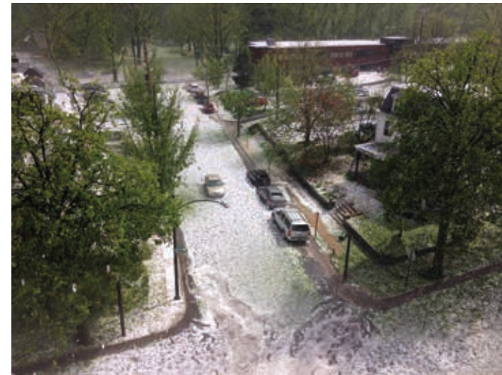
Corner of Hill Avenue and Reading Avenue.