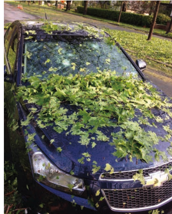
Broken windows, dents and leaves from shredded trees.