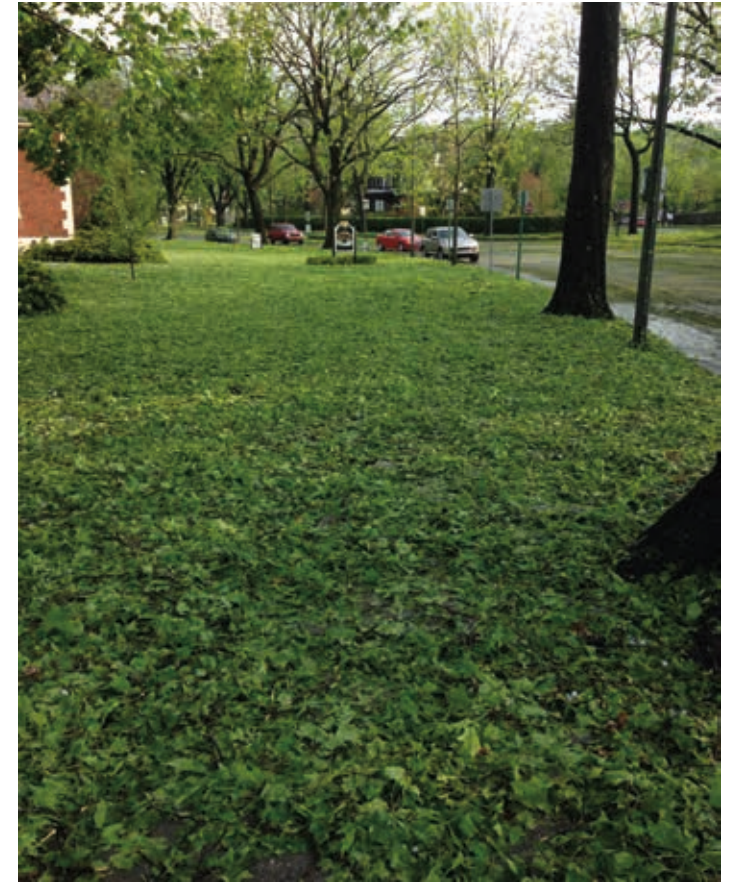
The sidewalk covered at the Wyomissing Public Library.