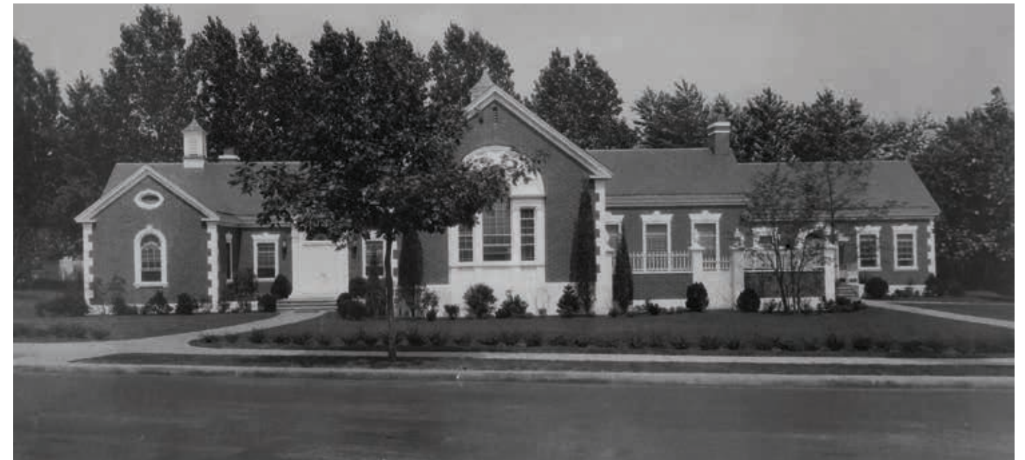
1931 photo Wyomissing Public Library