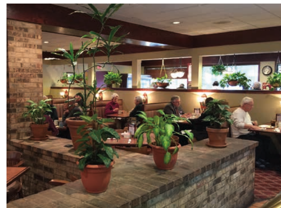
Large comfortable main dining room.