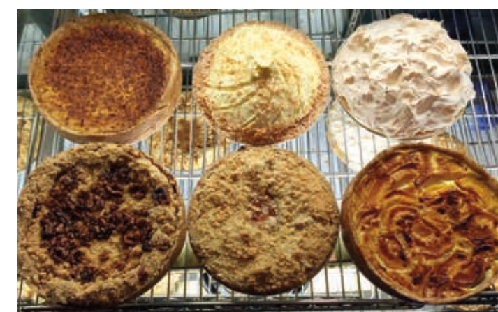
Homemade pies baked at Giannotti's.