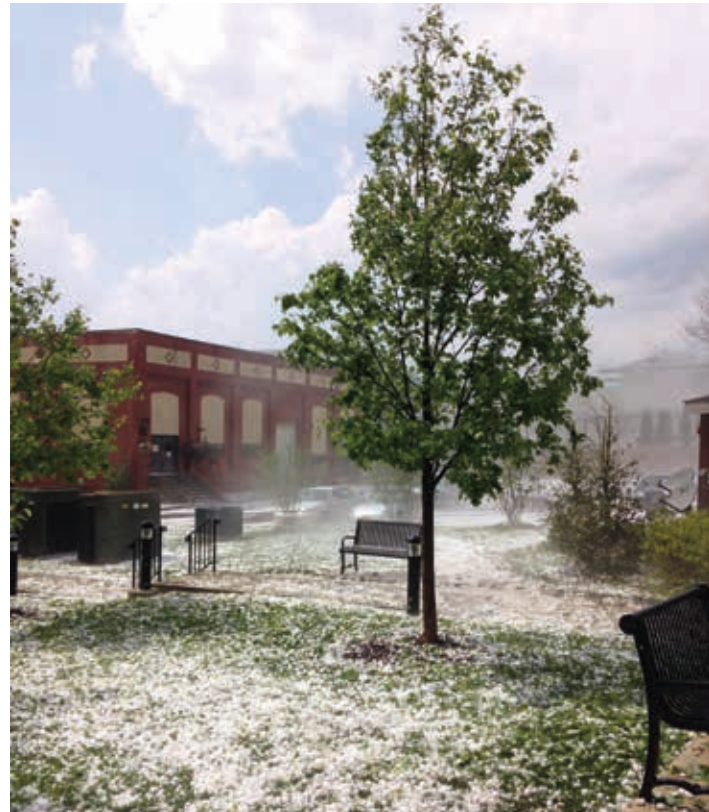
After the storm the sun appeared and eerie fog rose over the icy hail stones.