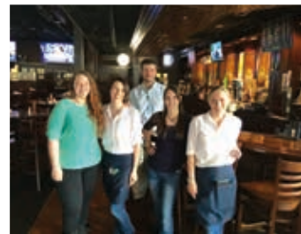
The staff at Willoughby's Bar and Grill, Wyomissing.