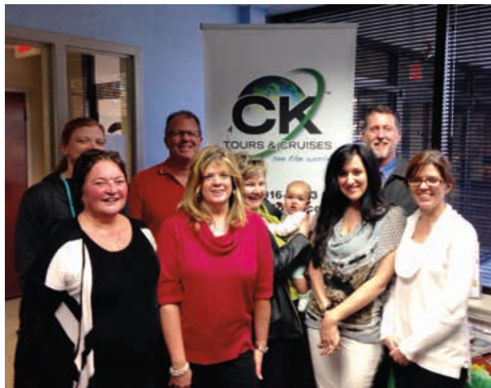
CK Tours & Cruises and Goodlife Financial Group hosted an open house celebrating CK Tours new office space in Wyomissing