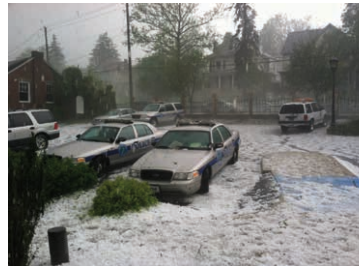
Wyomissing Police Department vehicles dented and broken.